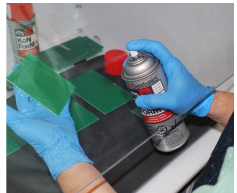
Closeup of operator spraying conformal coating under the 30" DSH.