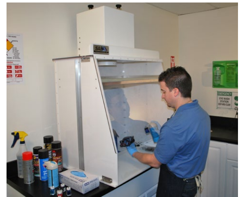
30" DSH provides fume control for a variety of aerosol spray applications.