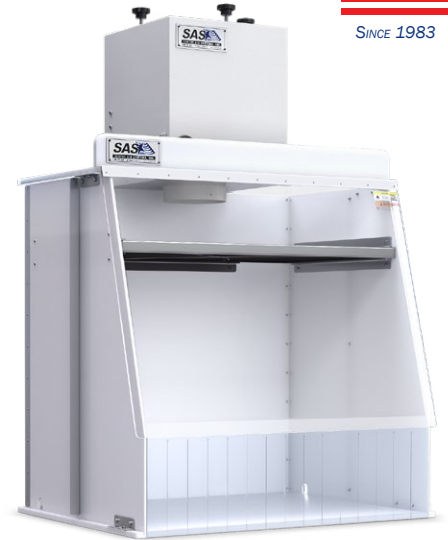
30" Ductless Spray Booth