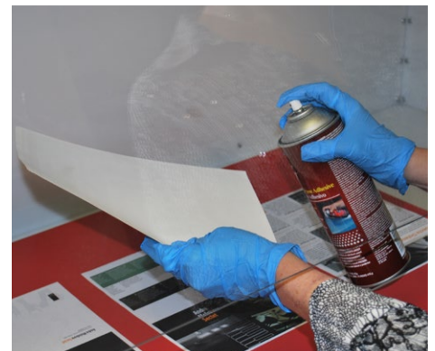
Closeup of operator safely spraying adhesive under a DSH.