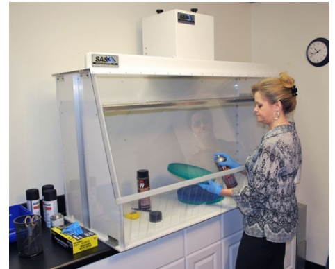
The Ductless Spray Booth provides fume control for a variety of aerosol spray application (60" pictured).