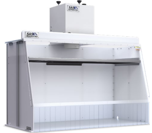
50" Ductless Spray Booth

The 50" Wide Ductless Spray Booth features energy efficiency, quiet operation, and low maintenance. Customized Spray Booths are also available for customers with specific application requirements.