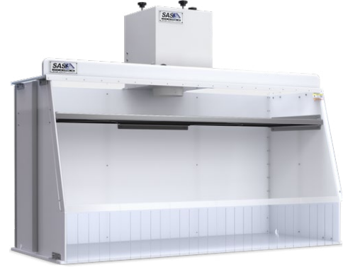
60" Ductless Spray Booth

The 60" Wide Ductless Spray Booth features energy efficiency, quiet operation, and low maintenance. Customized Spray Booths are also available for customers with specific application requirements.