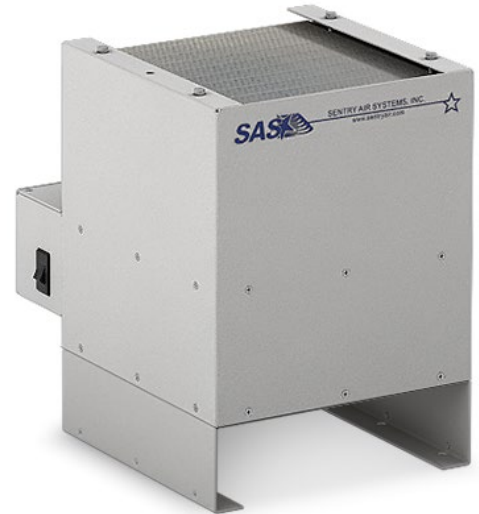
Model 200 Table Sentry

The Table Sentry fume extractor offers an effective, quiet and economical solution for many benchtop operations which require fume extraction.