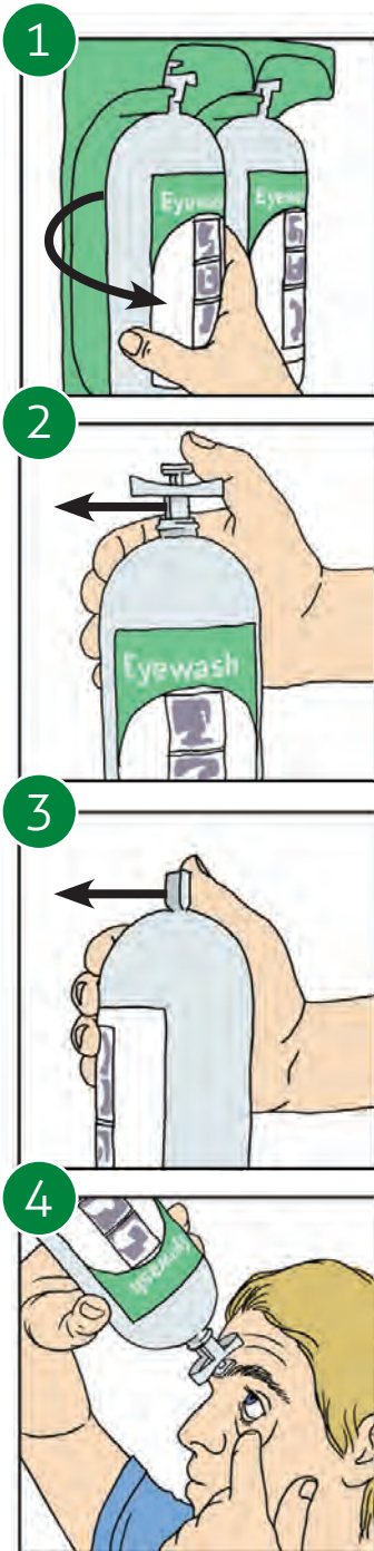
Secure eyewashing in four easy steps

TOBIN'S EYEWASH SYSTEMS are a well proven, quick and safe way to wash chemicals from the eyes. This specially designed system gives the fastest possible application combined with a volume large enough for most eye accidents.