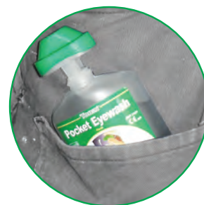
The Tobin pocket eyewash flask for breast and back pocket