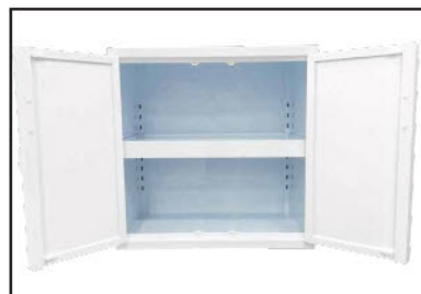
Doors open nearly 180° for easy access