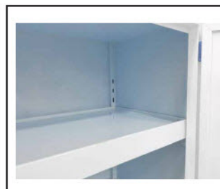
Removable and adjustable shelves