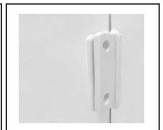
Accepts padlock for added security