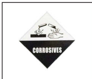
Clearly labeled for CORROSIVES