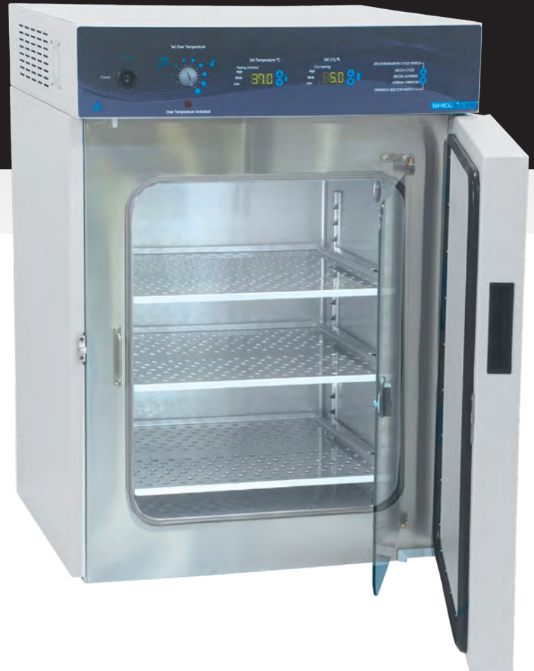
Decontamination Cycle Time