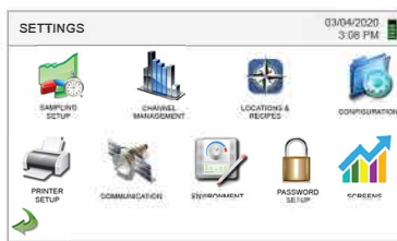
Icon Driven Menus for Ease-of-Use