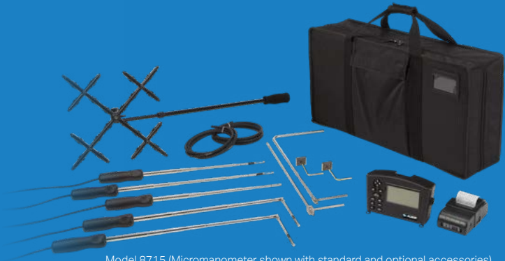
Model 8715 (Micromanometer shown with standard and optional accessories)

The 8380 AccuBalance® Air Capture Hood includes a detachable 8715 micromanometer—one of the most advanced, versatile, and easy to use micromanometers on the market today.