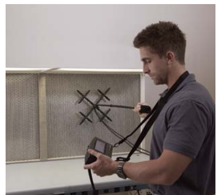
Plug and play thermoanemometer probes enables use in multiple applications.